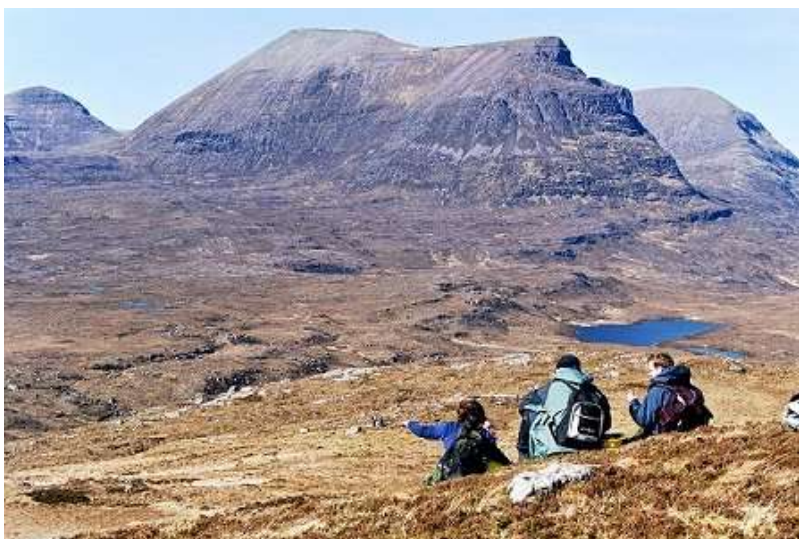
Precambrian red sandstones, laid down by river systems 1000 million years ago, make up the bulk of the mountain Quinag.

The principal focus of the course, however, is on recording information, and on the techniques of geological mapping. Mapping is one of an Earth scientist's most fundamental skills. It comprises the ability to record and interpret the three-dimensional patterns and relationships of rock bodies, and to work out the sequence of events that formed them. As part of the training, students learn: