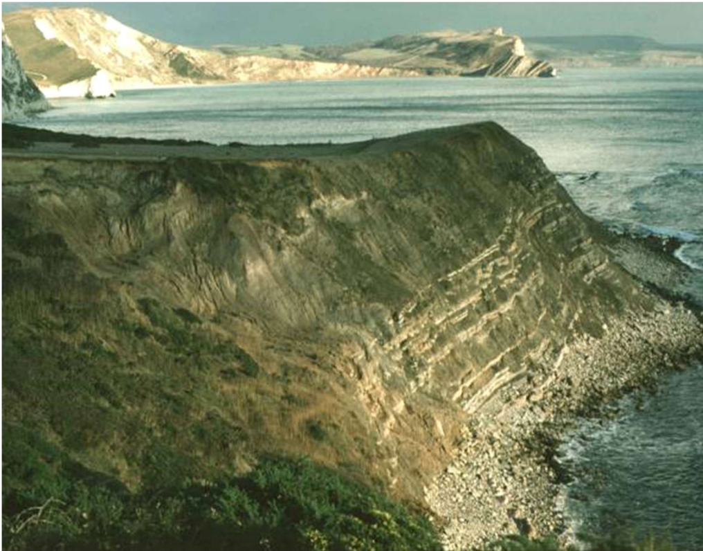
Worbarrow Bay, Dorset. The Late Jurassic to Cretaceous sediments were folded during earth movements related to the Alpine mountain-building.