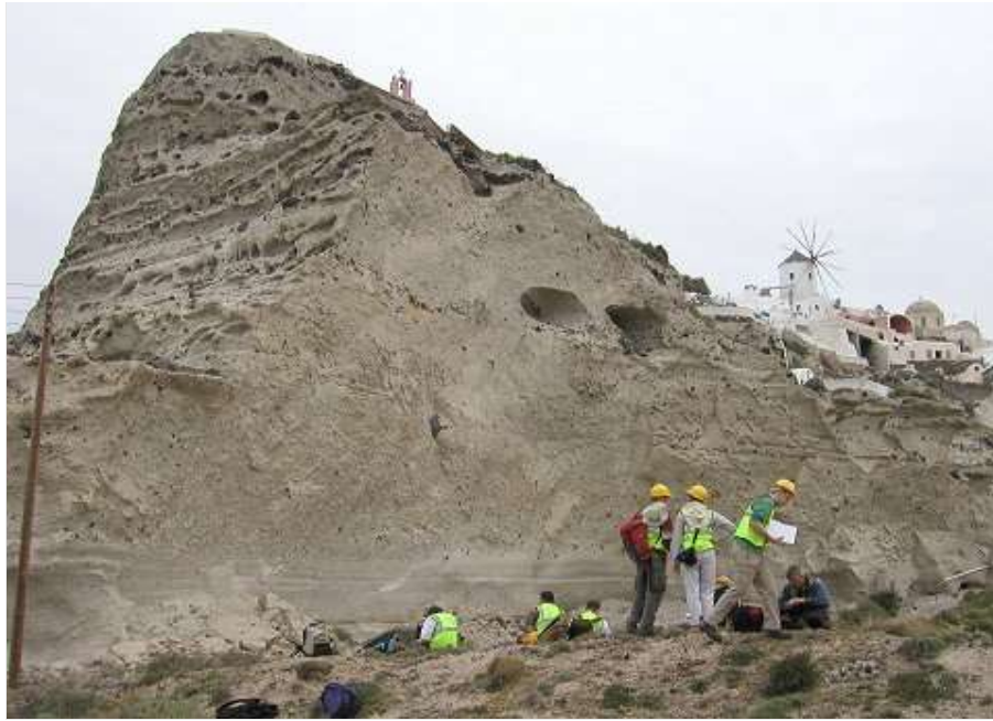
The Minoan deposits at Oia. The Minoan eruption deposited up to 10 metres of volcanic deposits, initially as fallout, but then as hot pyroclastic flows, about 3600 years ago. This eruption entirely wiped out civilization on the island, and may have played a significant role in the collapse of the Minoan civilization centred on Crete.

Days 4 to 10 are spent on the mainland of Central Greece. We begin in the Locris area, at the north end of the Gulf of Evvia. We learn about the pattern of faulting related to extension of the crust, its control on sedimentation, and the sequence of faulting through time, by observing features of the landscape around Kamena Vourla, Kallidromon, and Parnassos. We then move South to the Gulf of Corinth, stopping on the way to visit the active faulting near Thebes, including the 1981 Plataea-Kaparelli fault scarps. The Gulf of Corinth preserves a variety of sediments deposited during its evolution, and in particular reveals the interplay between movements of the crust and sea-level change.