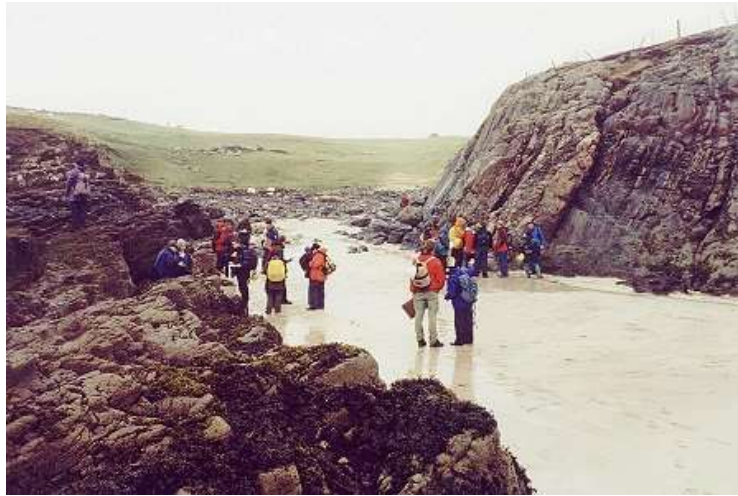
Looking for the unconformity: on the right, banded metamorphic gneisses formed in the deep crust, uplifted, eroded, and locally covered by a veneer of sediment; on the left, shallow-dipping siltstones and sandstones of the 1200 million-year-old Stoer Group, which overlie the gneiss.