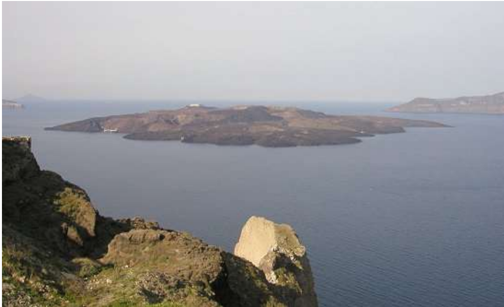
The island of Nea Kameni - the site of active volcanism in the centre of the present Santorini caldera. This island is visited by boat during the field course in order to see very recently erupted volcanics, and ongoing hydrothermal activity.

Days 1 to 3 are spent on Santorini, examining the great variety of eruptive rock types and the details of the volcanic sequences related to major eruptions. Evening exercises include using field data to calculate the duration and volume flux of the Minoan eruption. We also see the destructive power of the eruption at the Minoan excavations in Akrotiri.